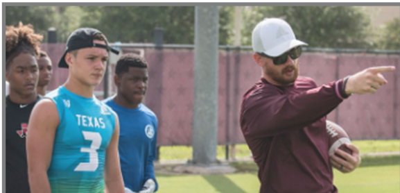
TPC Youth partnered with Central Coast FCA and YFC during FCA's Futures Camp July 18-21

TPC Youth Group resumes in SEPTEMBER! Middle School: Tuesdays 7-8:30PM High School: Wednesdays 7-8:45PM