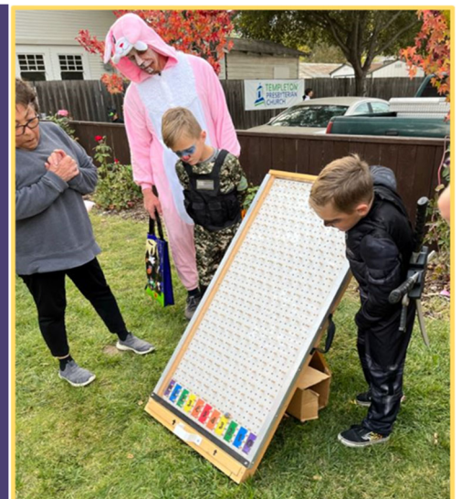
A great turnout and fun time last year!